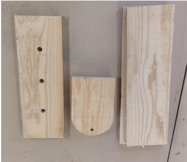
Cut out pieces