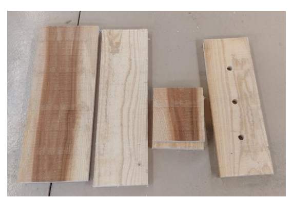
Cut out pieces