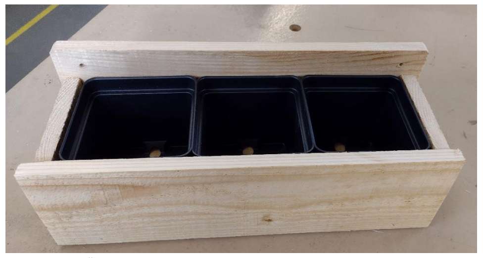
Project with 4" pots