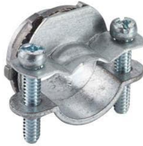
NM Cable Connector