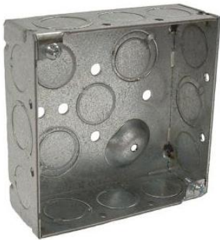
4" Square Box