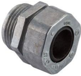
Strain Relief Cord Connector