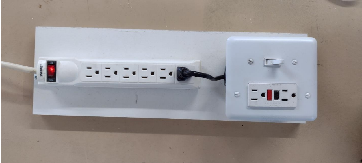
Completed Project Tester