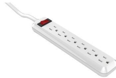
Typical Power Strip with Switch